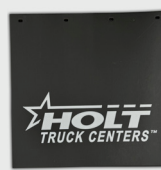
24X24 Mudflaps 101328-1