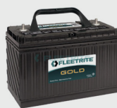
31XHD Batteries Part #FLTBT31XHD