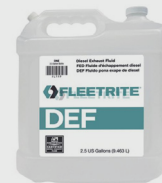
Fleetrite DEF Part #FLTFP