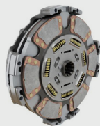
Genuine Eaton Clutch, Manual Adjust Part #C10892525AM