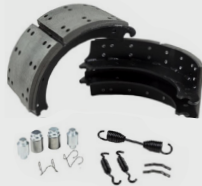
Fleetrite Brake Kit Abex 20k Part #FLTSN4707QPK